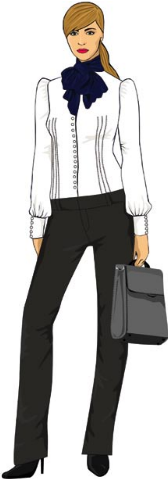
You - the fashion entrepreneur!